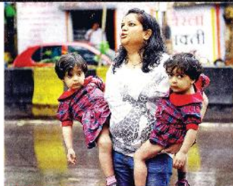
BALANCING ACT: A mother takes her identical twins to school