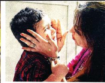
IN SAFE HANDS: A mother convinces her son not to cry and enjoy his day

04 MID DAY PHOTO FEATURE > 18.06.2013 > PUNE, www.mid-day.com