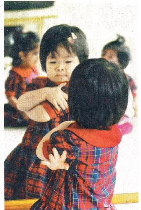
MIRROR MIRROR ON THE WALL: A girl admires herself