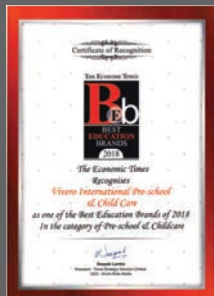
Economic Times Award