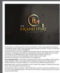
The Brand Story Award