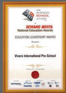
Dewang Mehta Award