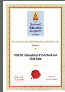
National Education Award