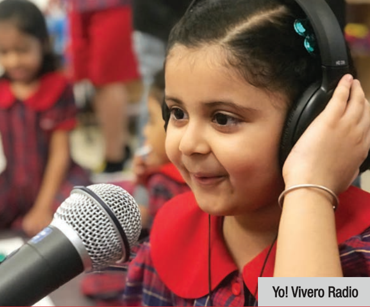
Yo! Vivero Radio