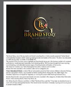
The Brand Story Award