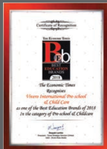
Economic Times Award