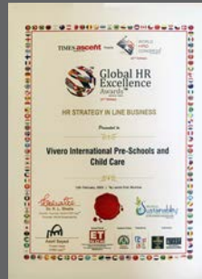
Global HR Excellence Award