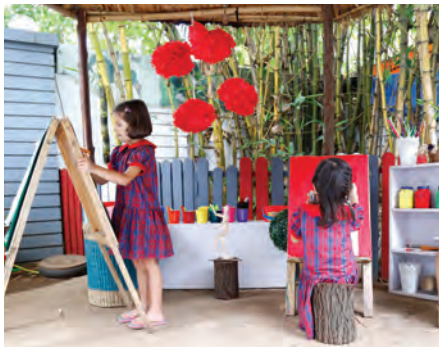
Freely expressing ideas in the art atelier set in the outdoors