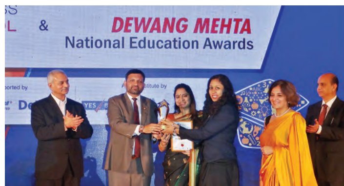
Our Serra team receiving the award