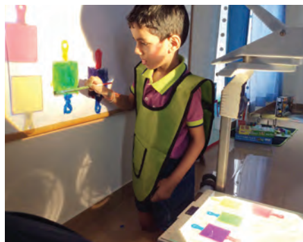
Exploring colour mixing in the atelier of light and colours