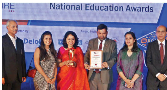
Our Vivero team receiving the award