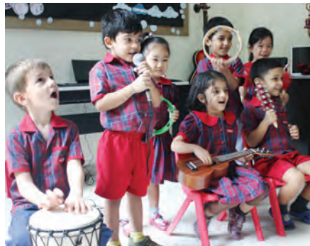
Exploring different musical instruments and co-ordinating to create melody