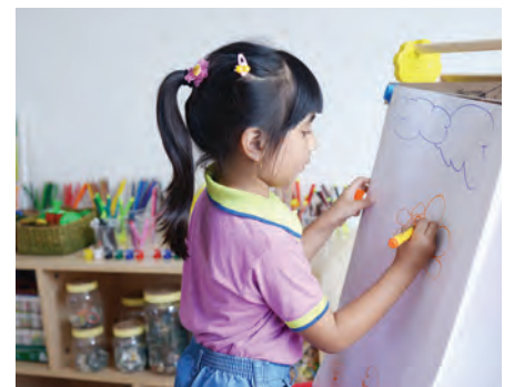
Expressing ideas on the easel board in the art atelier