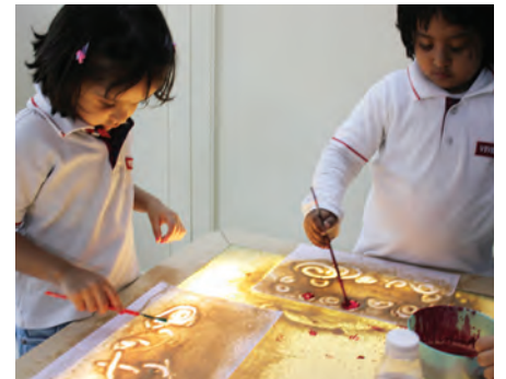
Experimenting on the light table by combining two different media