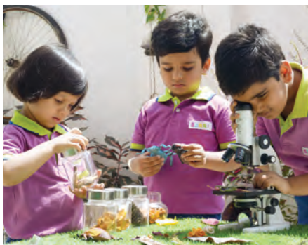
Investigating the natural materials in the atelier of life