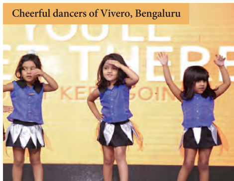
Cheerful dancers of Vivero, Bengaluru

A glimpse into the frolic at our Annual concerts: