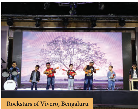
Rockstars of Vivero, Bengaluru