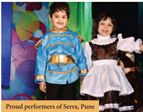
Proud performers of Serra, Pune