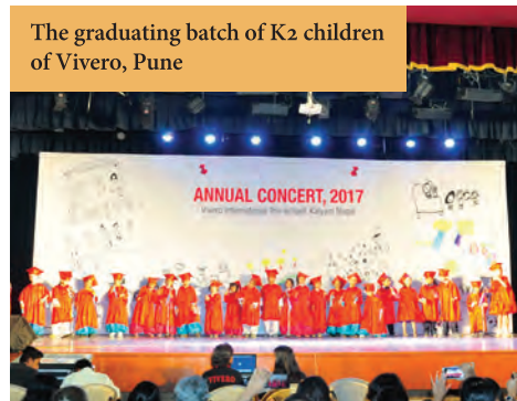
The graduating batch of K2 children of Vivero, Pune