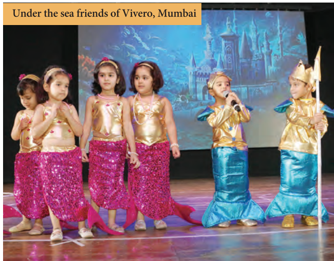
Under the sea friends of Vivero, Mumbai

Annual concert is one such event which each one of us (including children, parents and teachers) look forward to. It gives children an opportunity to showcase their learning before a live audience. Planning for the concert begins much in advance and our teams ensure that it is an enjoyable as well as a memorable moment for the children. Participation and experiential learning thus form the key aids of multi-tasking and this is what the children exhibited at the show. Our teams weaved the performances around dynamic themes like 'Spectrum of colours', 'Elementos De Tierra', 'Magic Bus', '100 Languages of Children', 'Twirl around the World', 'Toyland', 'Spectrum of Colours' and 'Lights, Camera, Action'