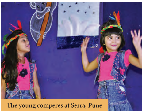
The young comperes at Serra, Pune