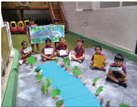
"Save Rivers & Forests" campaign

A glimpse of our pre-schoolers expressing their understanding of saving water for the future: