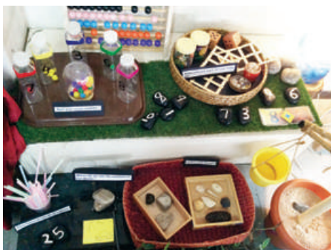
Exploring math concepts with open ended materials

This transformation will further empower our faculty to adapt to the digital innovation and integrate innovative learning methods to optimize student learning. Through this endeavor, teachers and the evolved curriculum together will transform our system to one that is reflective of the needs of today's children and the world.