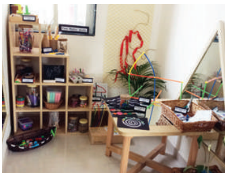
Multi sensorial corner to enhance fine motor skills