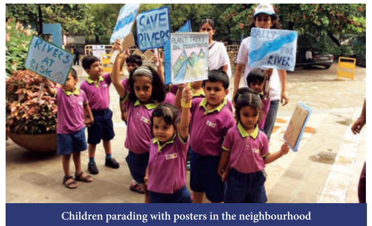
Children parading with posters in the neighbourhood