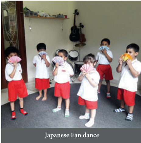
Japanese Fan dance