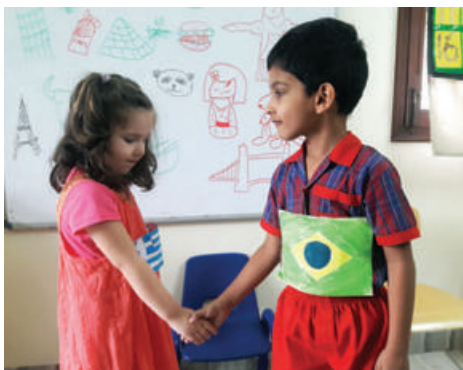
Introducing each other in different languages