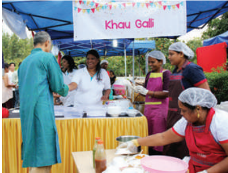
Satiating to scrumptious snacks served at Khauli Galli