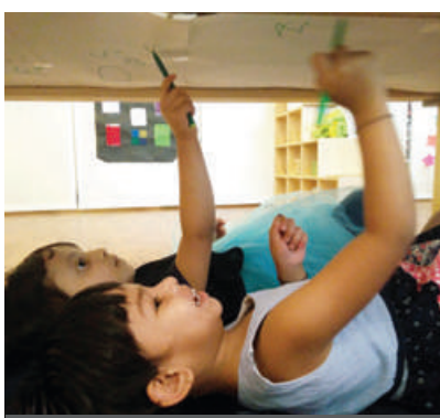
Painting ceilings, like Michelangelo