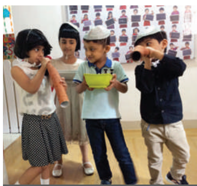
Blowing the 'Shofar' for Rosh Hashanah