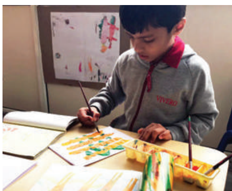
Drawing inspiration from Eric Carle