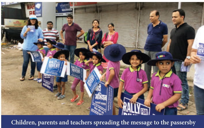
Children, parents and teachers spreading the message to the passersby