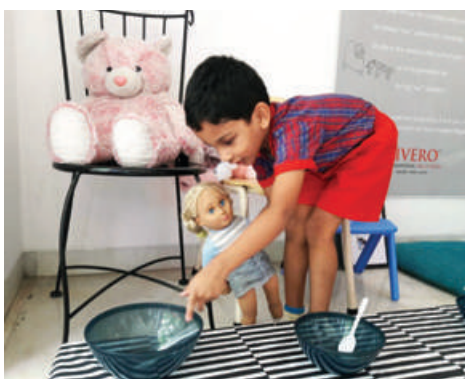
Narrating the story of Goldilocks & the Three Bears