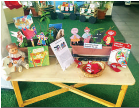
Provocation for various story telling techniques