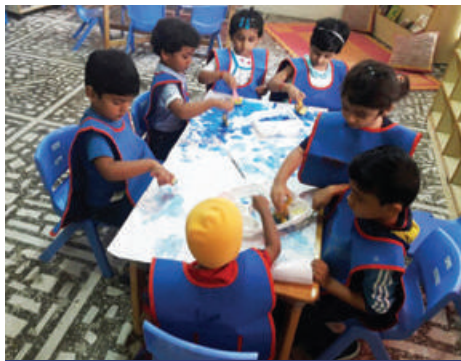
Creating posters for the campaign