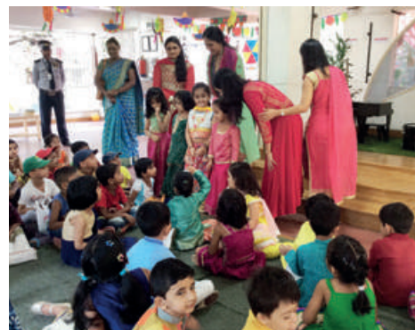
Sharing the Joy of Diwali