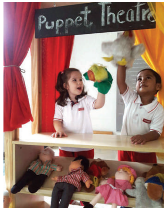
Narrating a story to their peers

A sneak peek into the Literacy week celebrations at our schools: