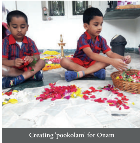
Creating 'pookalam' for Onam