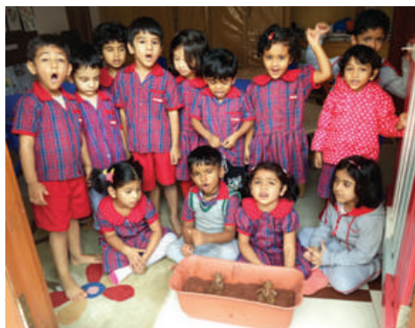
Immersing the 'eco friendly' Ganesha