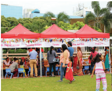
Parents and children engaged at the DIY stalls

This was a Carnival to remember! The children, parents and teachers created a bagful of delightful experiences and memories.