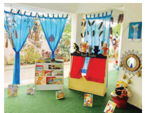
Library set up for the Literacy week