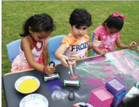
Children exploring the powdered colours to create Rangoli