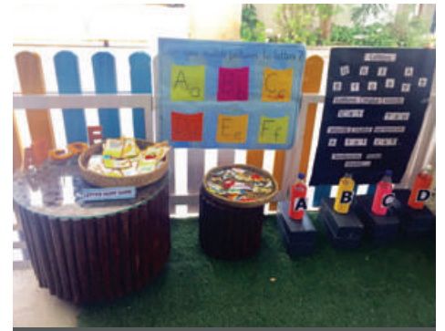
Literacy engagements for children to explore