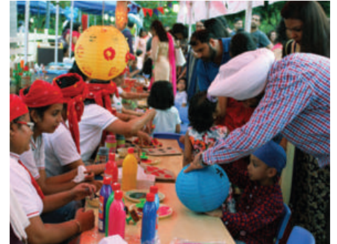
A father helping his child to create a lantern