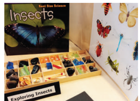
Using natural materials to explore insects