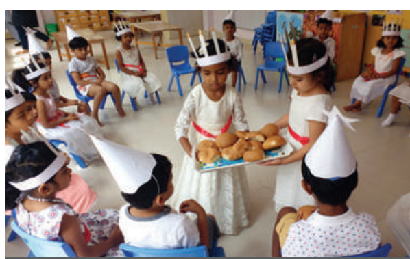
Celebrating St. Lucia's Day Festival