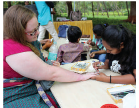
A parent enjoying application of herbal Henna on her palm