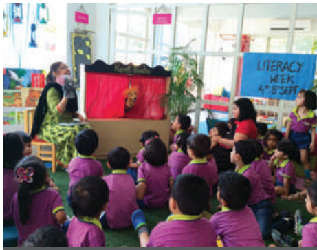
An enthusiastic grandmother narrating a story