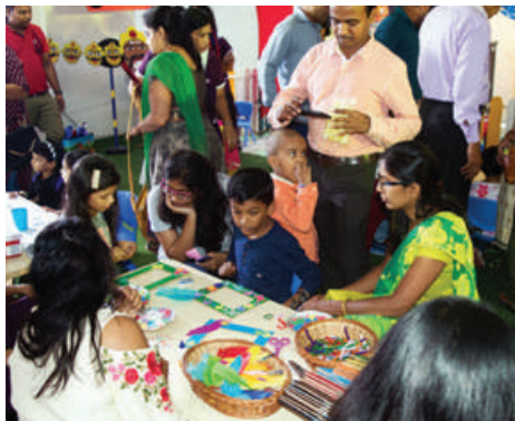
Children creating photo frames to capture their memories