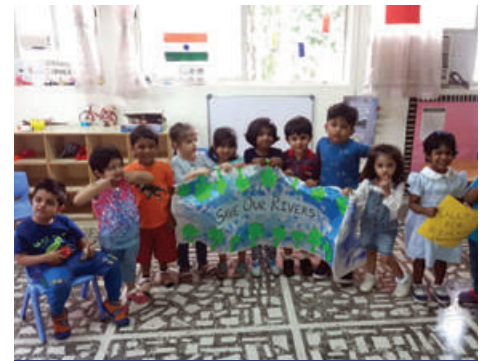
Spreading awareness within the school