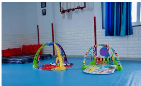
Infant Play Area