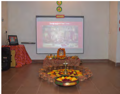
A typical Durga Pooja lighting set up