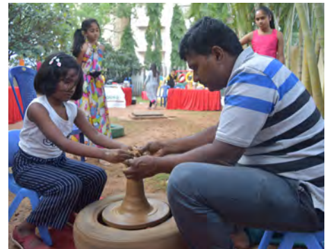
The joy of the Potters' Wheel

Vivero International, Whitefield went all the way and beyond to bring the spirit of ‘Habba’ which means ‘festival’ in the local lingo into the school premise. The event’s ethnic dress code brought out the vibrant colours of India. All facets of the ‘habba’ was showcased with handmade decorations such as the attractive streamers, beautiful rangoli and glittering diyas. It was a melange of performances by parents and children; a traditional puppet show; food stalls offering delicious Indian sweets and savouries; flea market and exciting prizes. What was even more delightful, was to see every child and parent tap their toes and rejoice to the traditional ‘Dhol’ music. The evening gave an insight into the richness and magnitude of the ‘habba’ as it brought together cultures, values and gave everyone just another excuse to celebrate the human spirit!