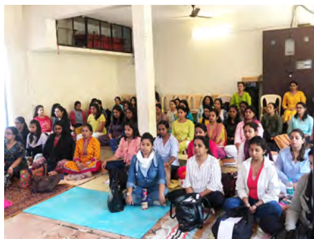
Coming together to learn from each other