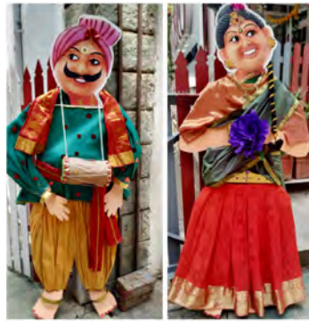
Traditional Village set-up