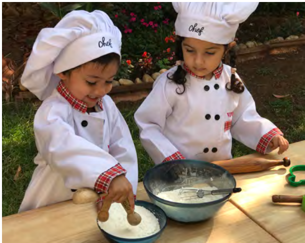
Happy Chefs make tasty meals

At Vivero, we believe that the best way for children to learn and develop is through self-experience and we consider that it is never too early to begin this process. Only through exploration and discovery can learning be fulfilled which is why we have introduced our culinary program as a major part of our childcare co-curricular activity.