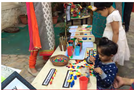
Children learn best when their natural curiosity is encouraged