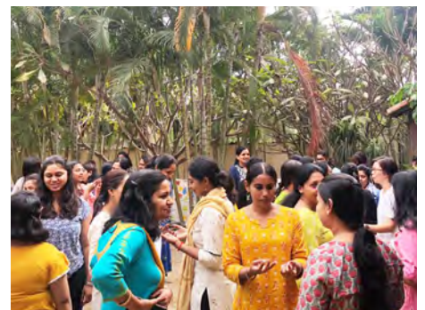
Drawing strength from each other's positive experiences