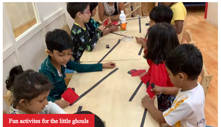
Fun activities for the little ghouls