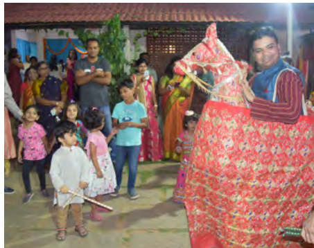
Traditional horse puppet at the fair