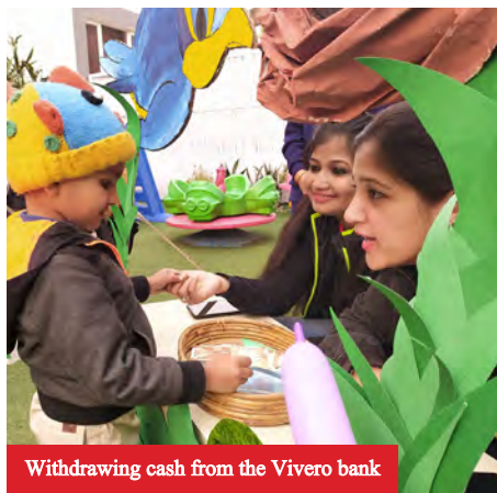
Withdrawing cash from the Vivero bank