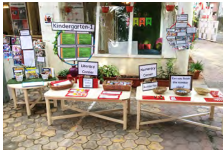
In-depth exploration of unique topics on display