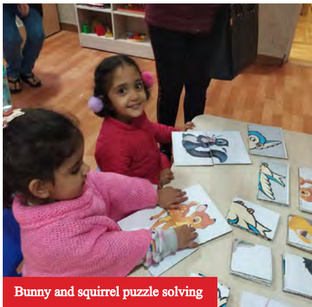
Bunny and squirrel puzzle solving

With the entire premise decked up in accordance of the jungle theme, the overall ambience matched perfectly well with the selected movie for the evening - Disney's 'Bambi'.