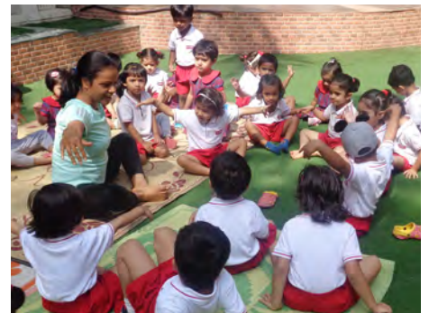
Mindfulness session in full swing with our learners