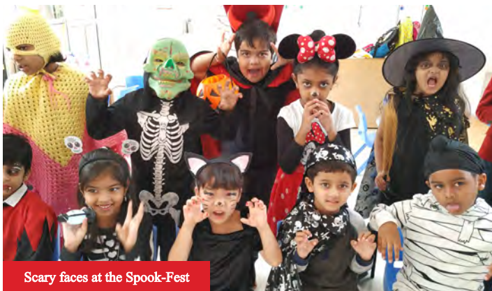
Scary faces at the Spook-Fest