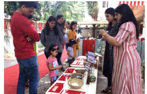
Every child has a unique learning ability