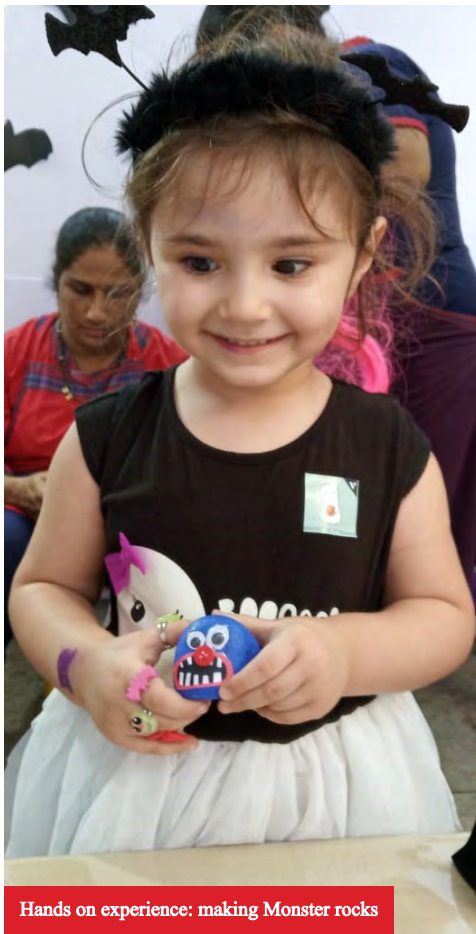
Hands on experience: making Monster rocks

Vivero International Pre-school and Child Care, Wakad hosted a Pre Halloween bash for all our youngsters on the 19th of October. The pumpkins, bats, witches, the creepies and crawlies, all had a fantastic time at school. Children engaged themselves in balancing on spider webs, and finding eyeballs and also knocking the ghosts out with pumpkins. Kudos to all our brave hearts.