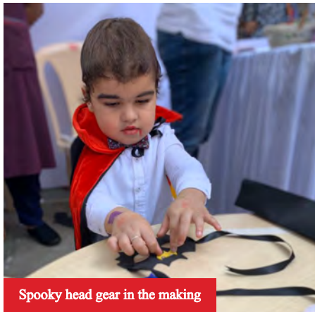
Spooky head gear in the making