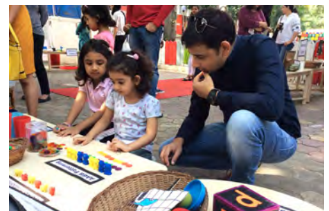
New parents get an insight into Vivero's unique curriculum

As an International pre-school & a new-age educational institution, we understand that it is essential to build an atmosphere of a healthy home - school partnership in order to achieve the goals of a child centric education system. We believe that to build mutual trust it is important to maintain an active line of communication and share information & address concerns on a regular basis. Hence, Curriculum Mornings at Vivero are specially planned in order to familiarize both new and existing parents with our philosophy, learning methodology, approaches and activities that children will experience through the course of the forthcoming academic year.