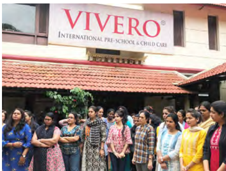
Professional & personal development through a mindfulness workshop for the teachers