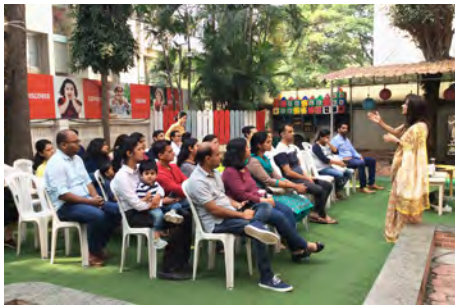
Familiarizing parents with Vivero's philosophy