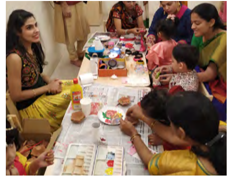
Habba - Bringing people together