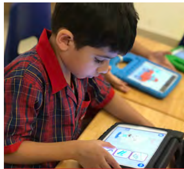
Age-appropriate tech curriculum

The programme, the gadgets and the apps are designed with the child in mind; simple to comprehend and easy to use. Our tech expert ensures that the teachers are trained and well versed with the usage of technology beforehand. During the tech-sessions, children visibly demonstrate increased levels of spoken communication and collaboration. Technology brings out positive effects on the cognitive and social learning skills of children too as it is generally observed that children begin to take leadership roles, share ideas on the I-pads and work together with their peers.