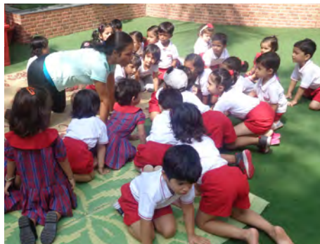
Learning the importance of co-existence