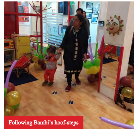
Following Bambi's hoof-steps