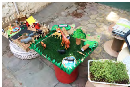
Learning through various units of inquiry