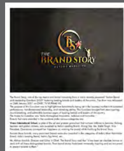
The Brand Story Award