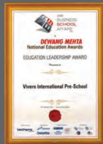
Dewang Mehta Award