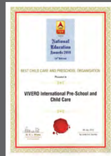
National Education Award