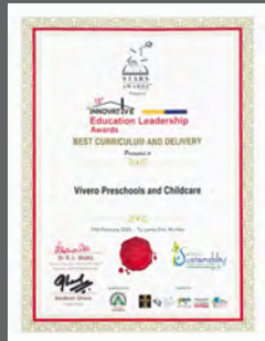
Education Leadership Award

Edvance Pre-School is an ISO certified company which is yet another reassurance of quality in processes to the parents of young children at School. Vivero International has been a proud recipient of various awards for the excellence in the field of early education and care.