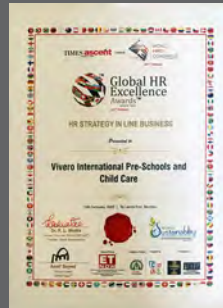
Global HR Excellence Award