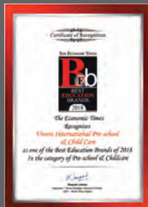
Economic Times Award