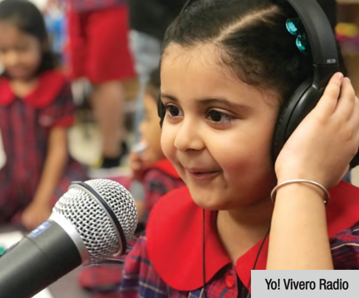
Yo! Vivero Radio